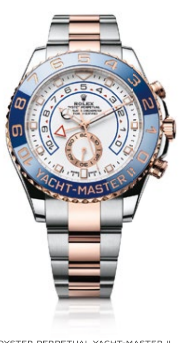
OYSTER PERPETUAL YACHT-MASTER II