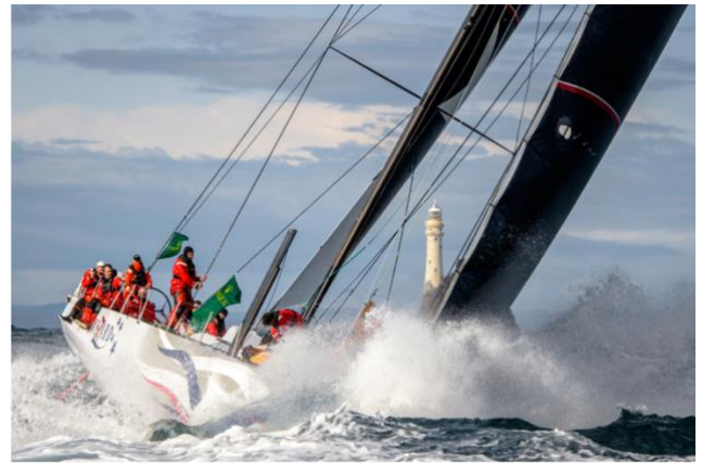
Rounding the Fastnet Rock is a pivotal moment for crews participating in the Rolex Fastnet Race.